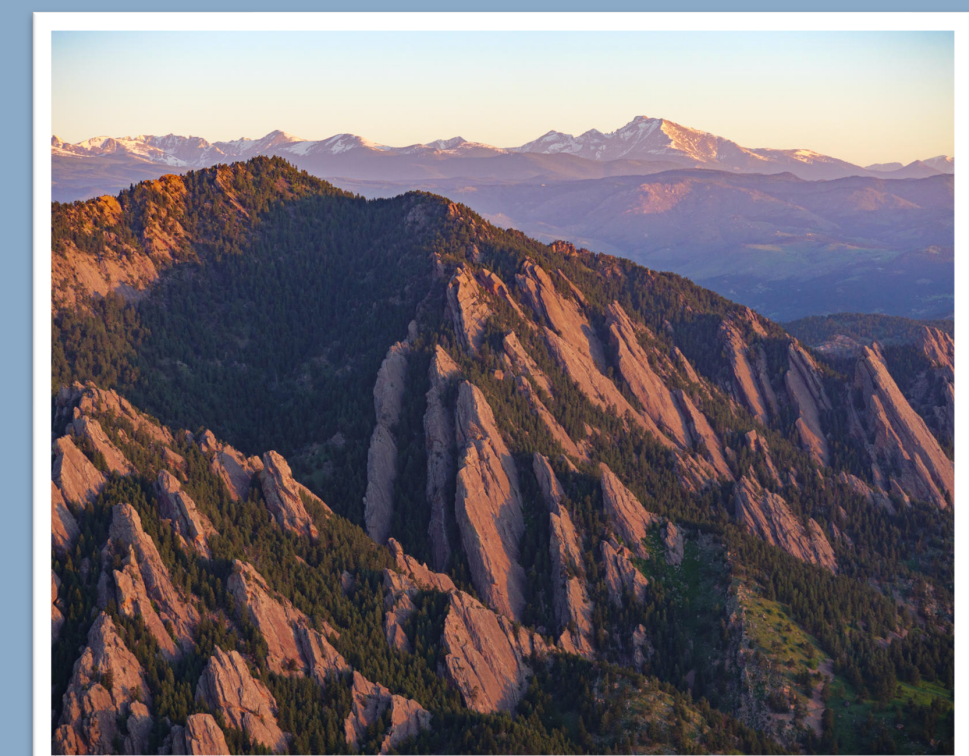
Flatiron mountains alongside Boulder, Colorado